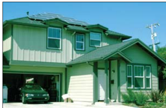
Color this house green: 179 Belvedere Terrace, Santa Cruz

City opts for sustainable building practices